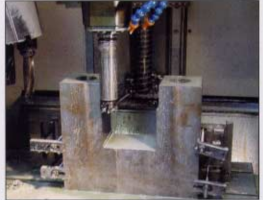
Utilising the very latest CNC machining centres, we can fully machine parts to 1 tonne