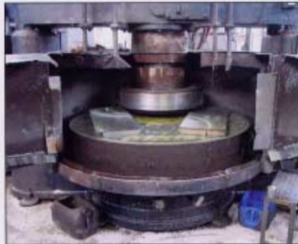
We are able to offer a complete grinding service, plate sizes up to 2m x 2m