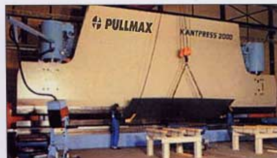
Pressed parts up to 12m