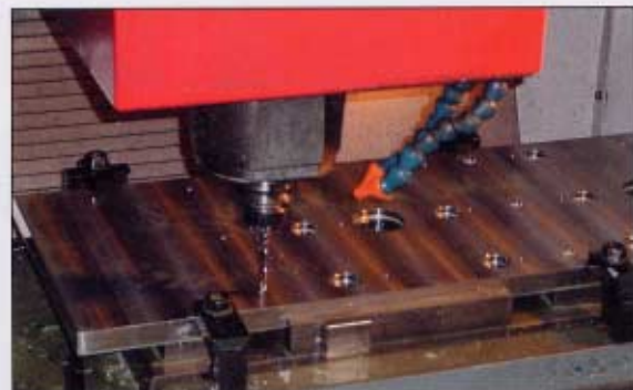
Drilled or tapped holes in your profiled parts. We can drill parts up to 20m long