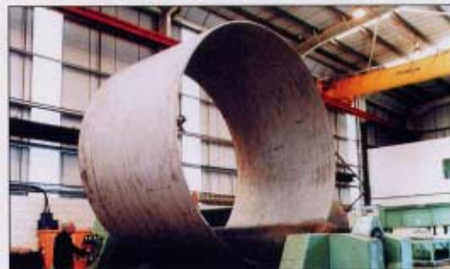
Complete rolled and welded shells to 4m wide. Hot rolling to 150mm