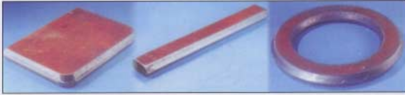
SHAPED Weld preparations both single and double in thickness to 110mm

With the ever growing need for finished parts rather than simple profiles we are delighted to offer a complete range of finishing services. Our list is not comprehensive and we would be delighted to quote you for any item from a small part to a complete bridge: