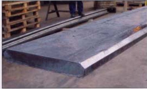
Straight weld preparations from 6mm to 150mm, single or double