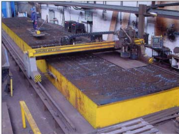
One of our oxy-plasma profiling machines. Capacity: Thickness up to 25mm, width 3m length to 20m