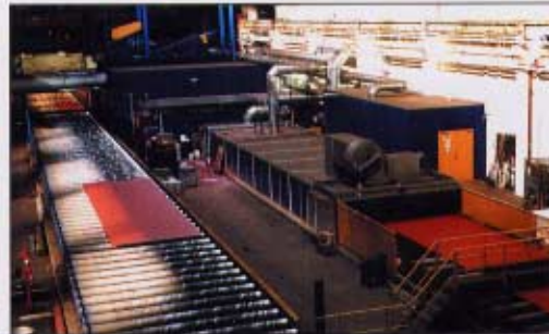
From small profiles to plates at 18m x 3m. We can offer a complete shotblast and paint service, all to your specifications