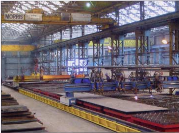
A View of 2 of our oxy-propane profiling machines Capacity: 500mm thick 20m long 6m wide plate weights up to 35 tonne